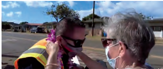
North Shore, Oahu