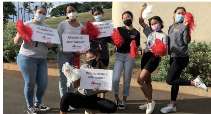
Sacred Hearts Academy Soroptimist Club cheerful volunteers