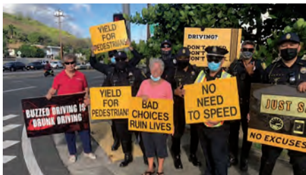
Hawaii Kai, Oahu