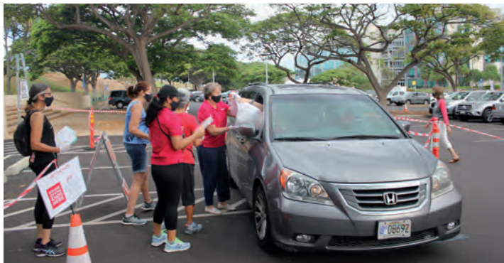
COVID-19 safe contactless handoff of goodie bags, t-shirts and cookies